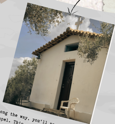
Along the way, you'll pass another small chapel. This one is open for viewing and is a nice spot to rest and catch your breath.

AT MAESTRO'S BAKERY, YOU CAN ENJOY DELICIOUS PASTRIES, SANDWICHES, AND FRESH JUICE, WHICH YOU CAN TAKE WITH YOU TO THE TOP OF THE MOUNTAIN. THIS WAY, YOU CAN CREATE UNFORGETTABLE MOMENTS!